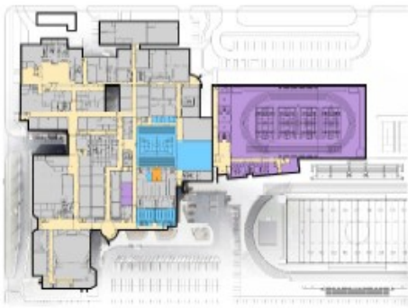
PROPOSED 1ST FLOOR PLAN