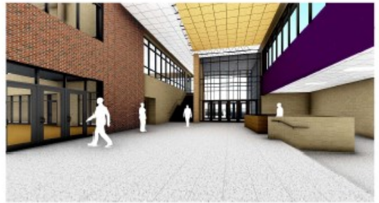
INTERIOR PERSPECTIVE OF COURT CENTER