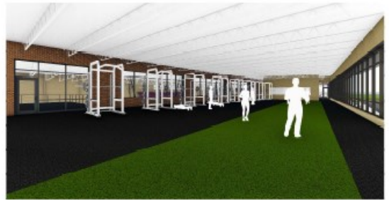
INTERIOR PERSPECTIVE OF COURT CENTER