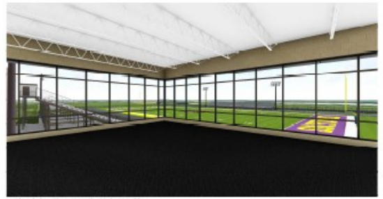
INTERIOR PERSPECTIVE FROM MULTILEVEL ROOMS AND BENCHES