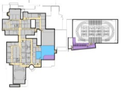
PROPOSED 2ND FLOOR PLAN