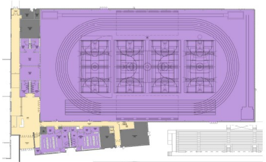
PROPOSED 2ND FLOOR PLAN