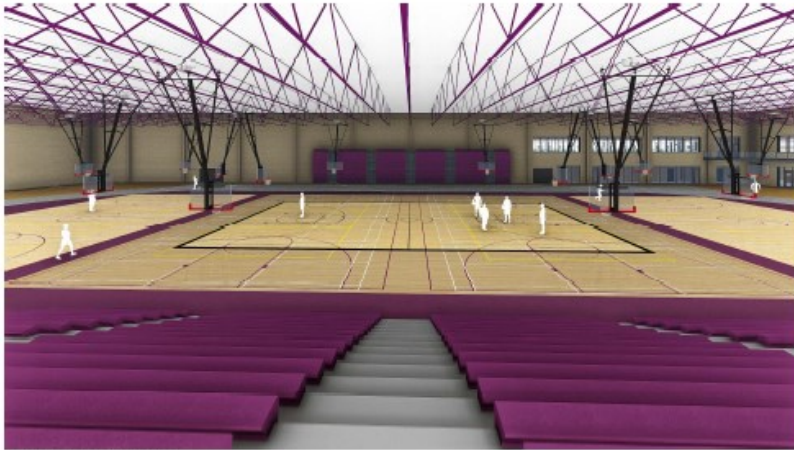
INTERIOR PERSPECTIVE OF BENCHES FROM STRUCTURE