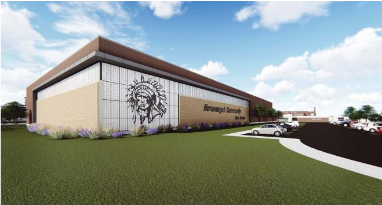
EXTERIOR PERSPECTIVE FROM NORTHEAST